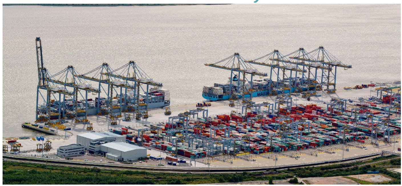
Maersk ships in at London Gateway