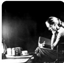
Celebrating Gombe 60 – Page 2