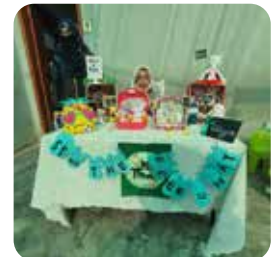
Seeds of Knowledge – Page 5