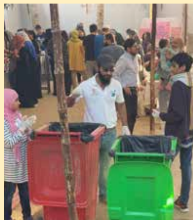
Recycling properly and with care

do more environmental projects in the future, even if it means they have to do it online. People can make a difference, no matter where they are!