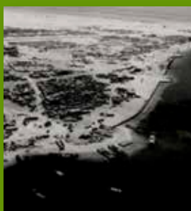
Abu Dhabi, 1960

Due to the unpredictability of our lives right now, although school has resumed, isolation rules remain. Therefore we've created some new resources that, in the event that your students term time is disrupted, can be done from home – check them out NOW!