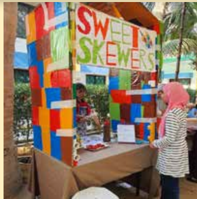
The food stall