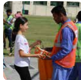
Throwback Project – Page 4