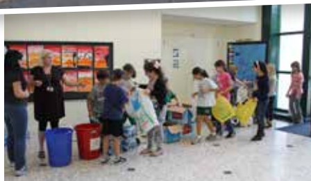
Packing the treat bags