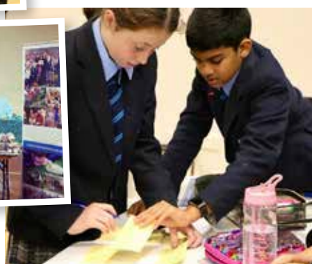
Holme Grange students writing pledges