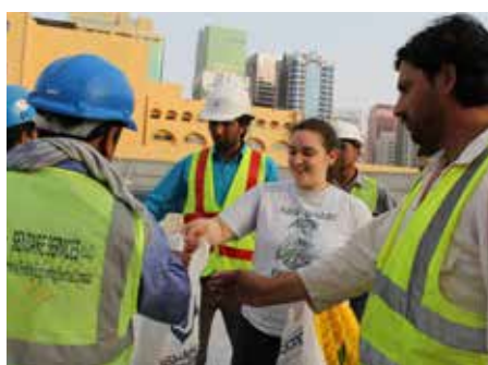
Giving treat bags to grateful workers