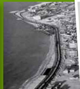
Abu Dhabi, 1974