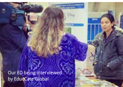
Our ED being interviewed by Educate Global