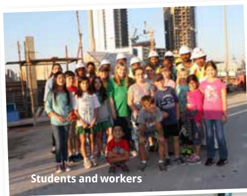
Students and workers

Laden with "treat bags" Roots & Shoots headed out to the Arabtec construction site and distributed a nice snack of a schwarma, apple, and water to 450-800 workers. After six weeks of organizing popcorn sales, collection of plastic bags, ordering water and shawarma, the students packed the bags and loaded the delivery truck. As one student commented during distribution, "600 is a lot." The larger impact is the opportunity to learn more about workers with their long hours and tough living situations. They took as many pictures of the students as the students took of them! "On a small scale, students step over the barrier of 'us and them' which is critical for any deeper social change in the future."