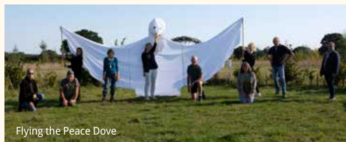
Flying the Peace Dove

The International Day of Peace ('Peace Day') is observed around the world every year on 21 September. The United Nations invites all nations and people to commemorate the Day through education and public awareness on issues related to peace. This year, the theme was 'Shaping Peace Together'. Here are the reflections of the day.