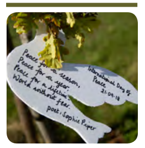
Let's celebrate – Peace Day 2020 – Page 6