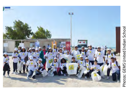
Desert clean-up campaign