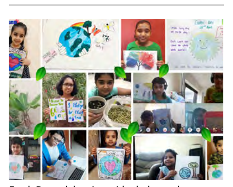
Earth Day celebration with pledge and microgreens