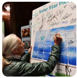
Our Roots & Shoots UAE Awards – Page 5