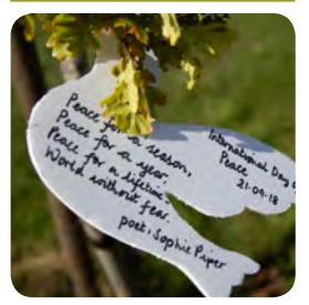
Let's celebrate – Peace Day 2020 – Page 3