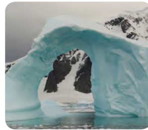
Winston Cowie's Antarctica experience – Page 5