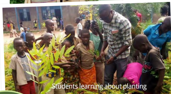
Students learning about planting

Besureis have raised over £1,000 to support this project! We Thank You!