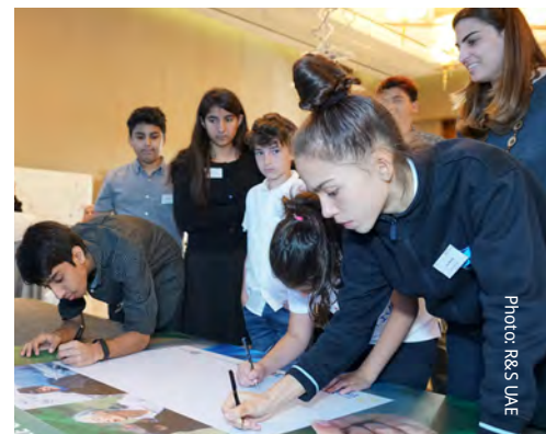
Committing to the Climate Force Challenge

The schools presented their work and then went to enjoy the turtle