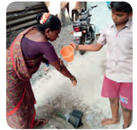
Our amazing members in India – Page 6