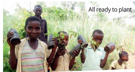
All ready to plant