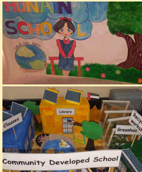
Creative projects, inspiring action to protect and preserve our environment

The projects were well researched and presented as animal stories, magazine articles, short stories, poems, dialogues and various other genres, the visuals and word choice was emotive and evoked the need for change.