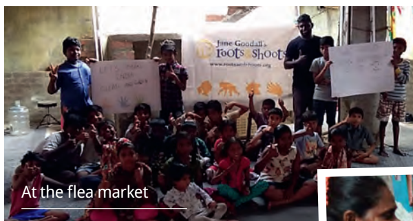
At the flea market