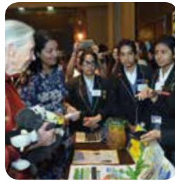
The spectacular AD annual awards – Page 2