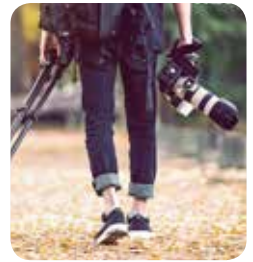
Win a trip on location in Canada – Page 5