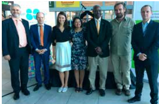
Roots &amp; Shoots at the Wild for Life Exhibition in Prague