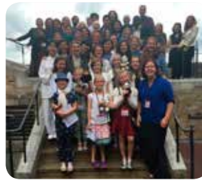
Represent R&S at Windsor Castle, UK – Page 4