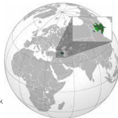
Map: By Interfase - Self-made from Azerbaijan (orthographic projection).svg, Public Domain, https://commons.wikimedia.org/w/index.php?curid=19232574