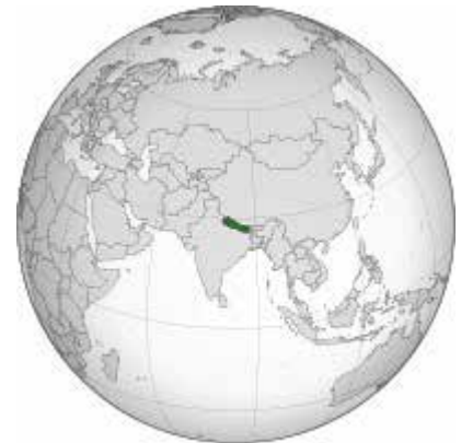
Map: By Addicted04 - Own work with Natural Earth DataThis vector image was created with Inkscape., CC BY-SA 3.0, https://commons.wikimedia.org/w/index.php?curid=16488530