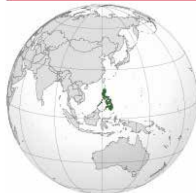
Map: By Addicted04 - Own work with Natural Earth DataThis vector image was created with Inkscape., CC BY-SA 3.0, https://commons.wikimedia.org/w/index.php?curid=16488530