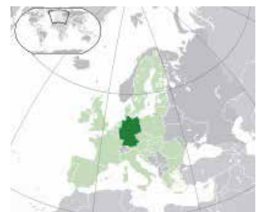
Map: By NuclearVacuum - File:Location European nation states.svg, CC BY-SA 3.0, https://commons.wikimedia.org/w/index.php?curid=8087888