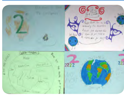
Applemore College Students have been inspired to take action – Page 5