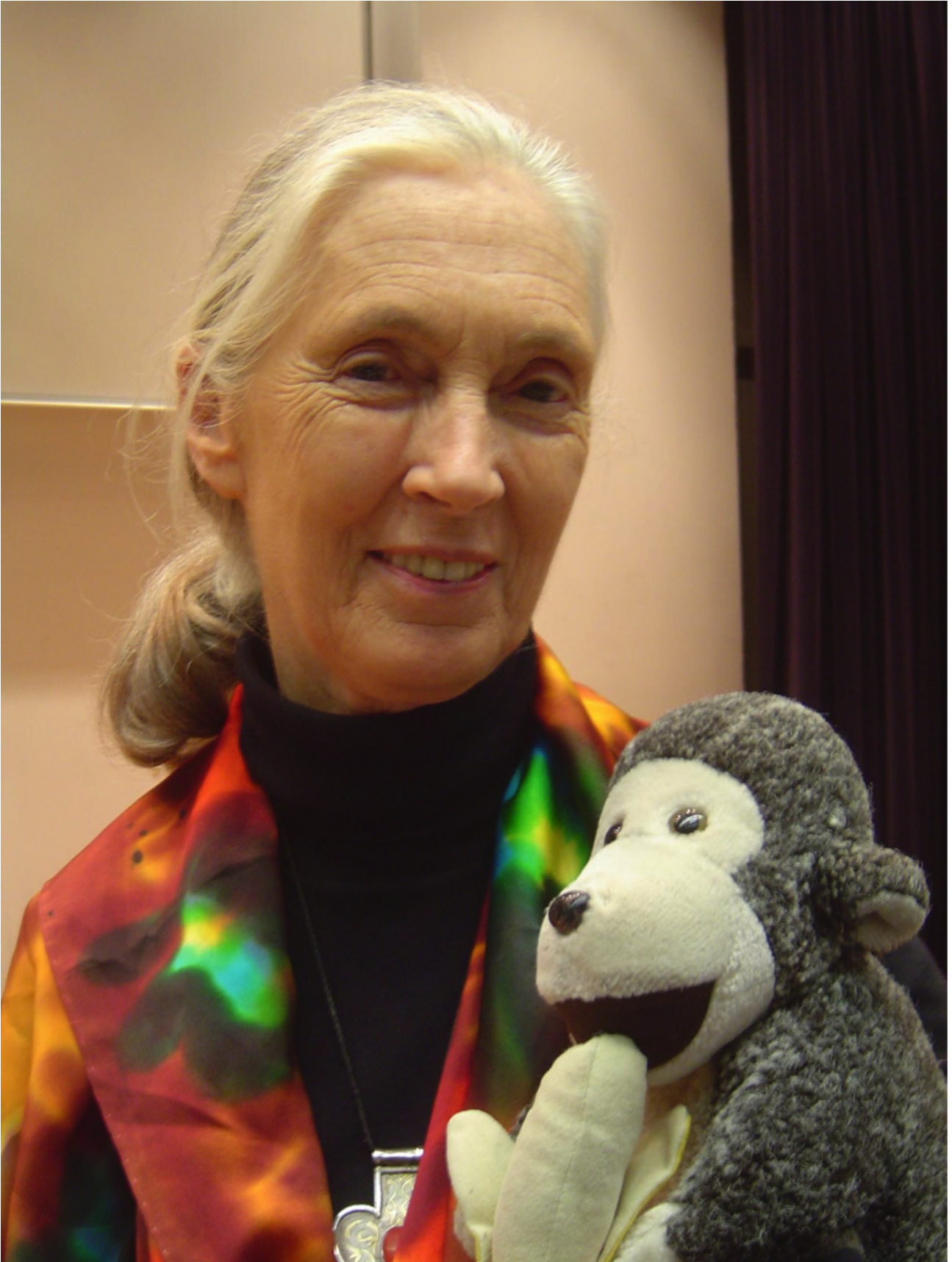
Photo of Jane Goodall