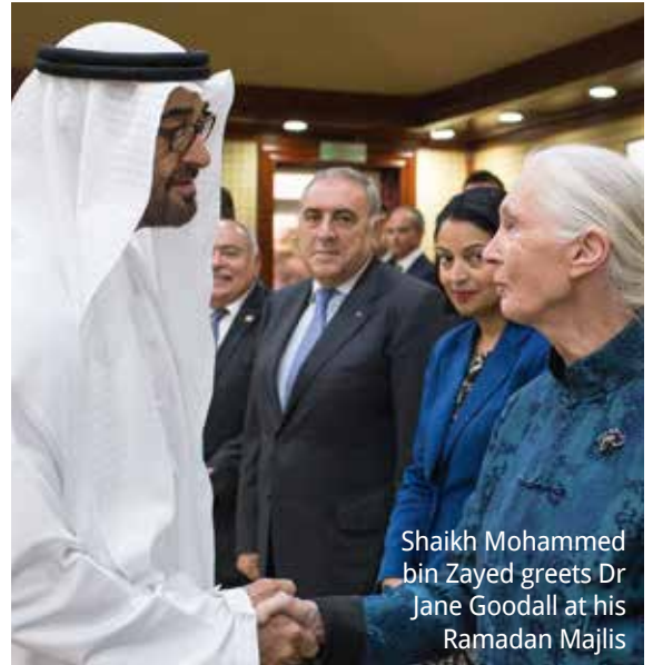
Shaikh Mohammed bin Zayed greets Dr Jane Goodall at his Ramadan Majlis

The lecture was a huge success and created an even stronger foundation for our Middle East programme.