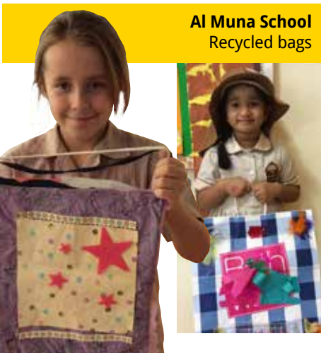
Al Muna School Recycled bags