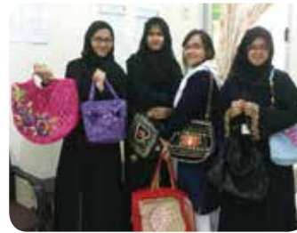
The Roots & Shoots Celebration – Page 5