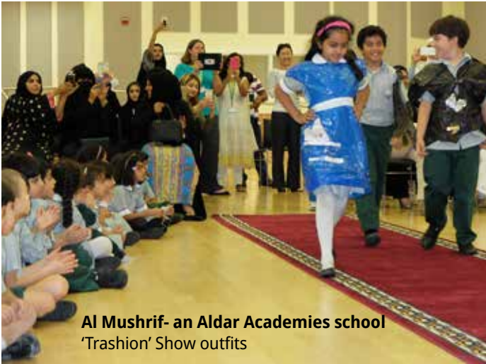
Al Mushrif- an Aldar Academies school 'Trashion' Show outfits