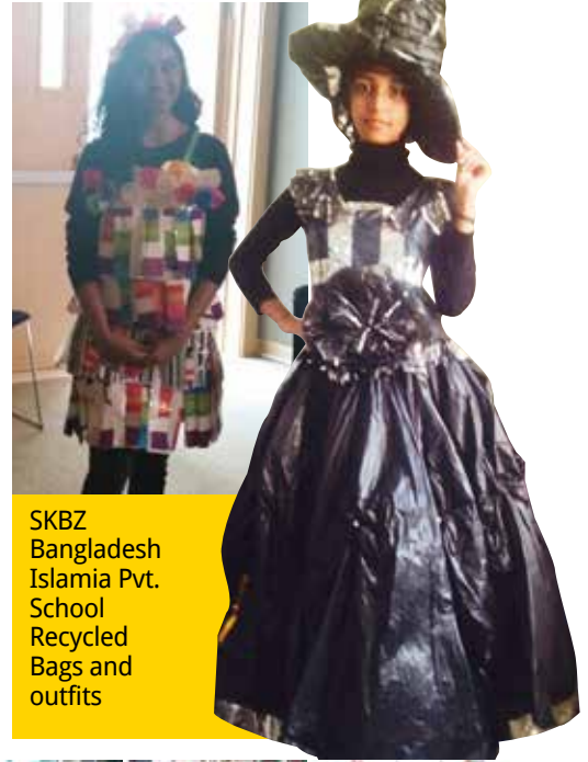
SKBZ Bangladesh Islamia Pvt. School Recycled Bags and outfits