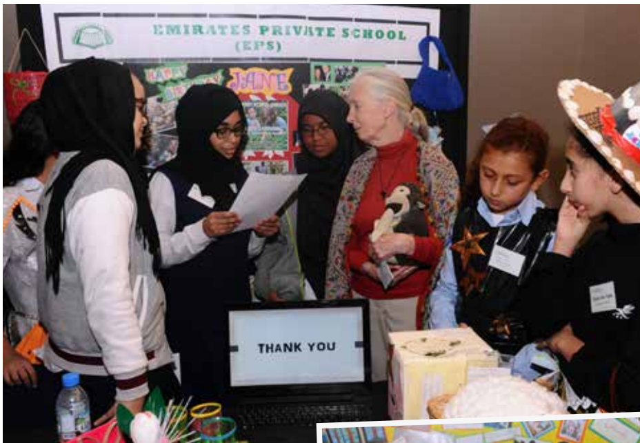
Dr Jane with Emirates Private School (above) and Al Muna Primary School (right) at the Roots & Shoots Awards.