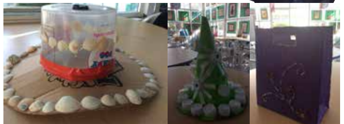
Emirates Private School Recycled hat and bags