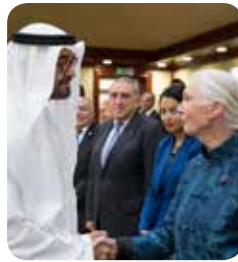
The Crown Prince lecture – Page 3