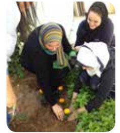
Our AD school projects – Page 6